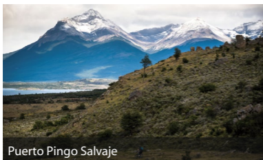
Puerto Pingo Salvaje