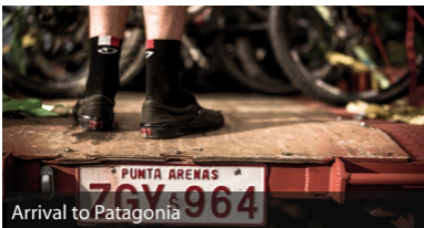
Arrival to Patagonia

Riding time 4-6 h. Skill Level: Intermediate+ / Fitness level: Intermediate+